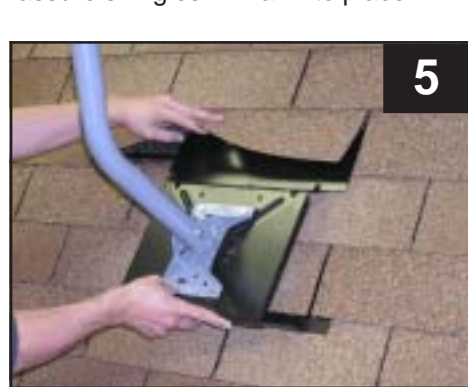
Lift upper shingle and slide deck plate under shingle, seat deck plate over base plate