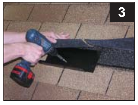
Install base plate with trusshead screws