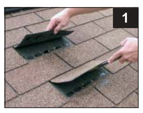
Locate truss with stud finder, lift shingles with prybar at dish location, do not lift middle row