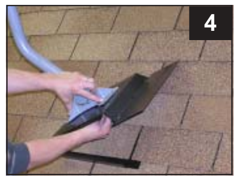
Install dish foot on deck plate with cap bolts