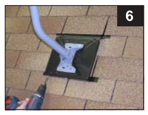
Use tek screws to secure deck plate to base plate