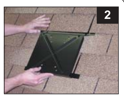
Before screwing base plate to roof, align both base & deck plate to assure shingles will fall into place