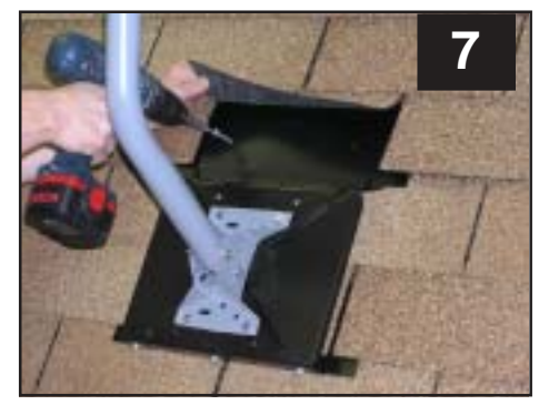
Lift shingle, install deck plate using trusshead screws, use small amount of roof cement under top shingle