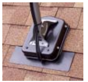
Dish foot is mounted to cover for easy install & removal